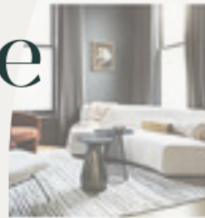
T | Living Room - Styling