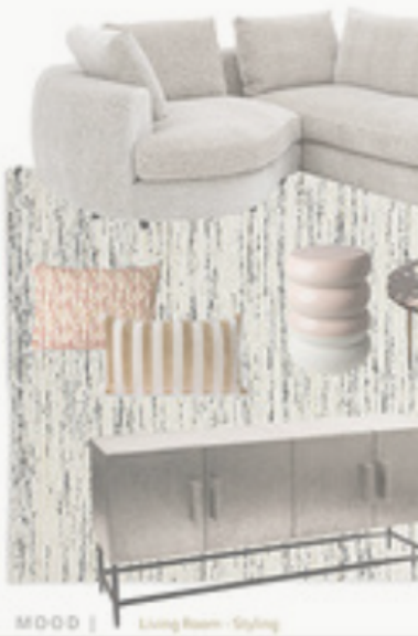
MOOD | Living Room - Styling